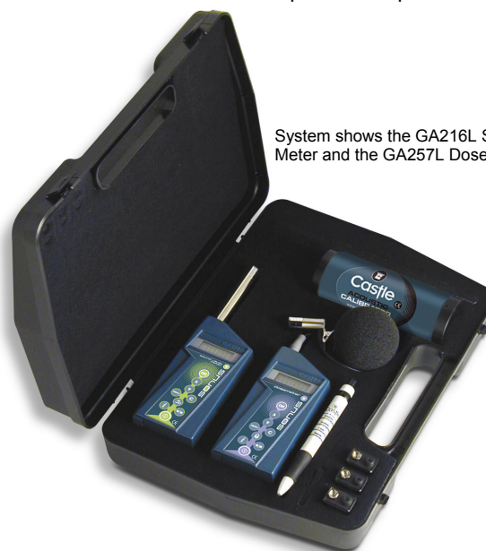
System shows the GA216L Sound Meter and the GA257L Dose meter