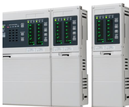
Indicator unit (2-channel)